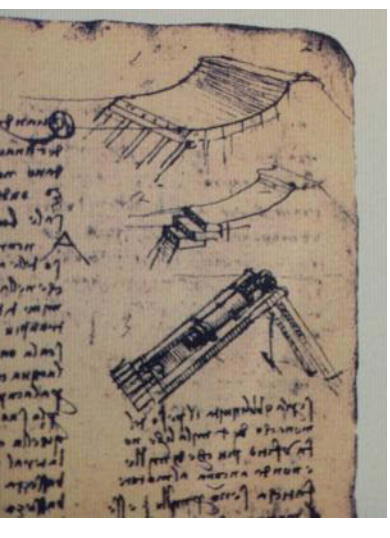
Codice Atlantico Published by EBS, Cartiere Federigoni, Verona, 2004. Bound by L'Arte del libro, Todi (PG). This is copy number 1875.