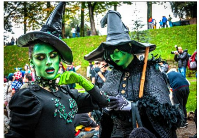
Comics & Games, November 2021