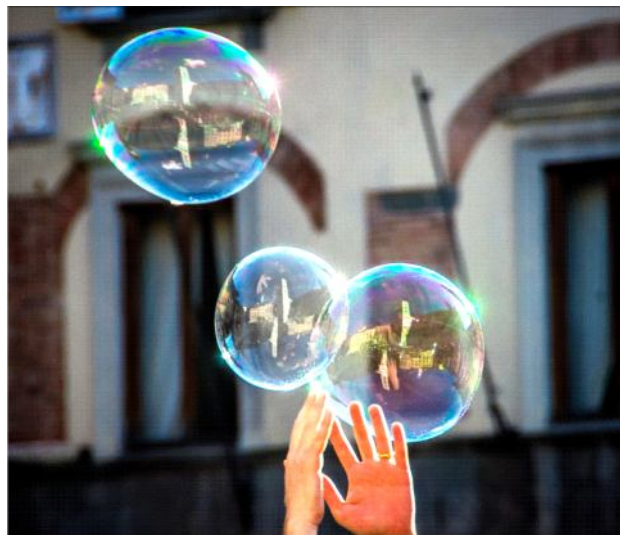
The Importance of Light , article by Maria Tsaosidou. December 2017/January 2018