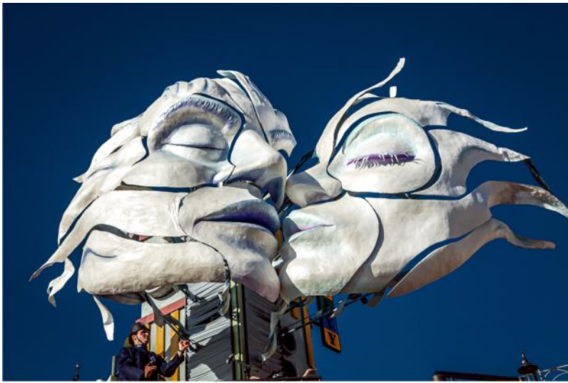
Carnival in Viareggio, March 2021