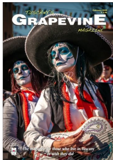
Tuscany's GRAPEVINE Magazine August 2023