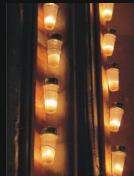
Lucca looks even more beautiful than usual with its candle-lined streets and thousands of enthusiastic people participating.