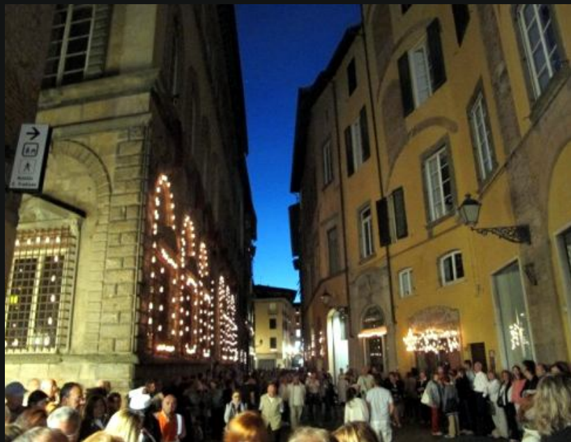
The crowds gather as night falls.

O n the evening of 13th September the streets of Lucca are lined with candles for the Luminara of Santa Croce. The festival's origins have been lost, but it has an ancient feeling as the crowds gather in the beautiful cobblestone streets. As night falls the citizens of Lucca, wearing medieval costume, carrying religious articles and singing hymns, form a procession through the streets: from the Church of San Frediano to the Lucca Cathedral, where they pray to the Volto Santo , a wooden sculpture of Christ. According to legend, the sculptor was Nicodemus, a disciple of Jesus. It was lost some time in the 8th century, but found and carried back to the town in 742.