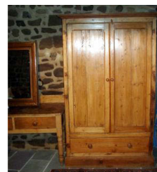
185cm x 124cm x 53cm

UK TV in Italy , all UK channels from £11.99 a month. 14 day catch-up. Let us show you how! Contact Grapevine for referral. (Ref 1142)