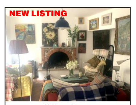
Village Home Beautifully restored property in Vergemoli, near Gallicano, in the Garfagnana mountains (30 km from Lucca). 2 bedrooms, kitchen, dining room, open fires. Gas range in the kitchen. Warm & cosy in winter, cool in summer. New chestnut windows & doors. Shop & bar in the village. Ideal for cyclists & nature lovers . € 63,500 (Ref. 1277)

Spacious workshop for creative projects (former photographer's studio), with luminous indoor/outdoor spaces. Covered terrace for outdoor meals or projects. Adjacent to this a 110sqm first-floor apartment on the main street of town. Purchase one or both spaces. € 330,000 total: € 220,000 workshop, €110,000 apartment. (Ref. 1227)