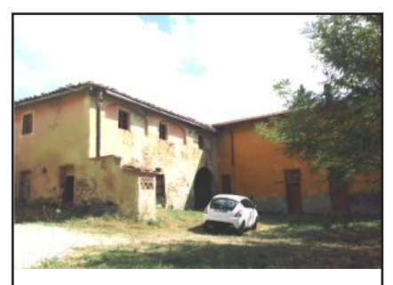
Ancient borgo in Valdelsa. Near Certaldo between Florence, Pisa, & Siena. 80 km from Lucca. Two large stone farmhouses & 3 barns, including a medieval tower now incorporated into the main house. Incredible views over the Tuscan countryside, with San Gimignano visible in the distance (13km). 1300sqm, to be restored. 1.5 hectares of olive grove, room for a swimming pool. € 630,000. Architectural plans for an agriturism are available. (Ref. 1273)