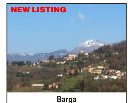
Medieval hilltop town 45 minutes from Lucca, with an international population. 3 bedroom 2 bath apartment with gorgeous views. Double glazing, gas fired central heat, terracotta floors, chestnut-wood doors & windows. Energy code F. € 165,000. (Ref. 1278)

Casa colonica not far from the sea & the Versilia coastline, with its own land & olive trees. Near Pietrasanta & Forte dei Marmi (12-13km). 4 bedrooms, 3 baths, 130sqm. Enjoy sweeping views from the large terrace. The outdoor spaces include a solarium (where a swimming pool may be added), wood-burner, storage unit, woodshed. Heated with city gas & thermo-camino. APE G.€ 285,000. (Ref. 1271)