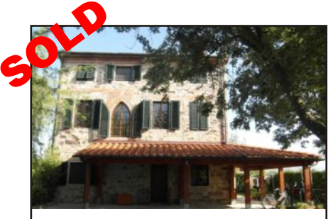
Capannori, 5 km to Lucca Centro

Beautiful gated family home with 2 kitchens, 4 bathrooms, 6-7 bedrooms, 300 sqm total. In traditional Tuscan style with solar panels, wood & gas burning fireplace, A/C, veranda shading the home in summer. On a quiet country road with views in all directions. This could be the ideal home for an extended family, small farm, or hospitality project. APE Cl. D. \in 390,000. (Ref.1228)