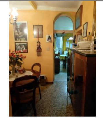
LUCCA CENTRO STORICO

Beautiful gated family home with 2 kitchens, 4 bathrooms, 6-7 bedrooms, 300 sqm total. In traditional Tuscan style with solar panels, wood & gas burning fireplace, A/C, veranda shading the home in summer. On a quiet country road with views in all directions. This could be the ideal home for an extended family, small farm, or hospitality project. APE Cl. D. \in 390,000. (Ref.1228)