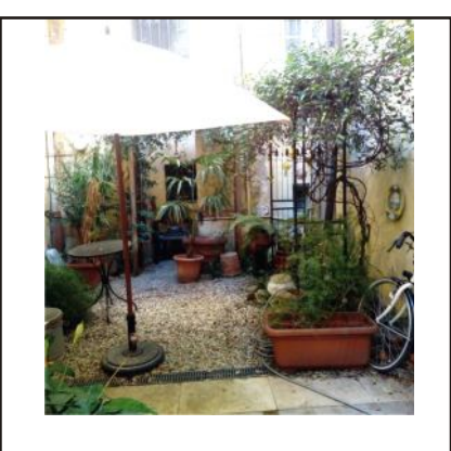
Cute, centrally located apartment with furnished kitchen and private courtyard (with greenery) in historic Lucca near the Duomo. Approx. 80 sqm. Ground floor, first floor. 2 bedrooms, 2 baths on a quiet street. \in 225,000. (Ref. 1276)

For more information: editor@luccagrapevine.com