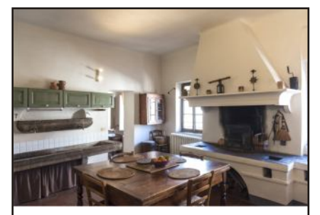
LUCCA CENTRO STORICO An apartment with the flavour of the Renaissance situated near the Torre delle Ore. On the top floor (70 easy steps, no elevator) with sleeping loft & skylights above. Huge kitchen, triple sized living room, spacious entrance hall, 4 bedrooms, 2 baths. Tessieri & wood floors, high ceilings. Many beautiful features. € 650,000. Ref. 1184.

Spacious first-floor apartment with living, kitchen, dining rooms, 2 bedrooms, 1 bath. A/C kitchen. 110sqm plus 36sqm garage. APE CI. G.€250,000. (Ref. 1247)