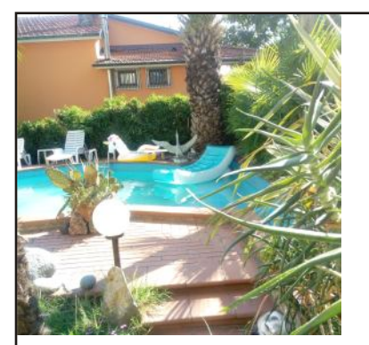
Romantic country home surrounded by nature with private plunge pool (6,8m in diameter) in a duplex situated between Collodi & Villa Basilica, 16km from Lucca Centro. One bath, 2 bedrooms, studio, sitting room, dining room, kitchen, garage, private parking area. Ground floor. € 120,000. (Ref. 1274)